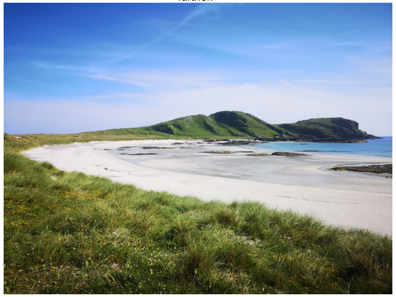
Photo below: the headland at Ceann A' Mhara , showing what would have once been an island. The fort of Dùn nan Gall did not appear easy to access safely, and a large, deep 'geo' (Gaelic geodha ) stopped me from going any further.

have been connected to the sea, and it is likely that the sea ran all the way to Loch Bhasapoll to the north of Loch A' Phuill, across the flat landscape around Barrapoll . Interestingly the location of the church just across the marsh/flatlands from Barrapoll may have originally faced the sea; of course it would not have been a Christian church back then, but the Christian Church may have been built upon an older sacred site, especially considering that there are several standing stones and what appear to be cairns within walking distance. This leads us onto the topic of brochs and forts in general, both of which in Gaelic are generally referred to as dùn 'enclosure'. Close to the mountain of Ceann A' Mhara in the southwest corner of Tiree there are two enclosures of forts; interestingly one of them is referred to as Dùn nan Gall -'fort of the foreigners'. Back towards Baile A' Phuill there is an enclosure very close to the coastline, referred to as Dunan Nighean and described by some locals as being a 'Danish' fort. According to the page for this site on www.megalithic.co.uk (The Megalithic Portal) evidence of midden material was found here, but I am unsure whether or not this means a shell midden.