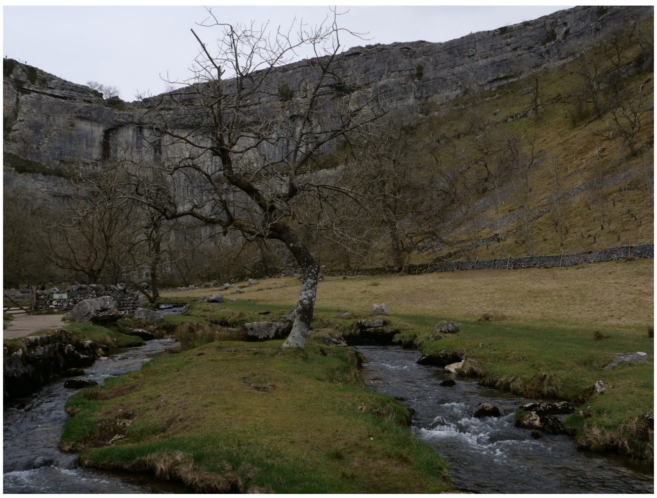
Photo above: landscape near Malham in North Yorkshire, a place where there appear to be a large number of medieval and possibly Iron Age Celtic field systems.

For the last article in this book I want to talk briefly about this area. These limestone uplands have been inhabited since the Mesolithic and Neolithic times, and perhaps the 'Cumbric language' is actually connected to those peoples. Even though Cumbric is sometimes described as being more or less identical to Old Welsh, the roots of the language in the landscape, which are often shared with Welsh, often have a quite obscure and possibly non-Indo-European etymology. So Cumbric is definitely connected to Welsh, but does that make the ancient language of this land Celtic necessarily? I am less certain. An example of a Cumbric place-name is Pen-y-Ghent. Even though it looks like Welsh, and the word pen is most definitely connected to Welsh pen – head, and the definate article y – 'the', 'of the', is the same, the third element, Ghent is of unknown etymology, and I do not think that a meaning of 'head of the border' or 'head of the wind' really fits, which I did think in the past, owing to the similarity between Welsh gwynt – wind, and Ghent. I do not think this fits semantically. I hope you enjoyed this book:)