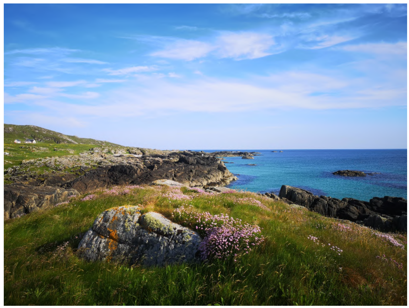
See previous page for comments on photo above.