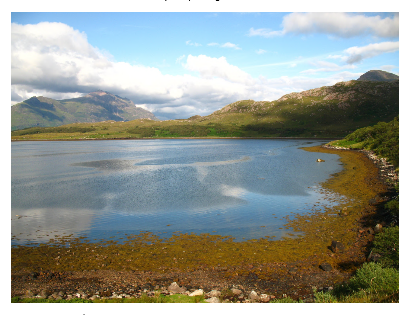
Photo above: Òb Mheallaidh , a shallow lagoon-like bay just to the south of the main Loch Torridon, Gaelic: Loch Thoirbheartan . I hope that this photo helps to give some idea of the majesty of this landscape. In my opinion this small area of the Scottish mainland has some of the best preserved natural environments in Scotland, both in terms of the indigenous Scots pine forests and in terms of the marine diversity. In this lagoon, I walked out some way

All examples or information marked with (1) indicate a reference to the Survey of the Gaelic dialects of Scotland edited by Cathair Ó Dochartaigh, and in this article all of these references are specific to the language of informant 118 from Torridon. Note that in some cases the phonetic spelling in (1) or simplification thereof is not given, and in these cases a reference to (1) may indicate that I have spelled Gaelic orthography for Torridon slightly differently according to some of the phonetic information in a word from (1), this includes for example spelling snaim - 'knott' as snaimb.