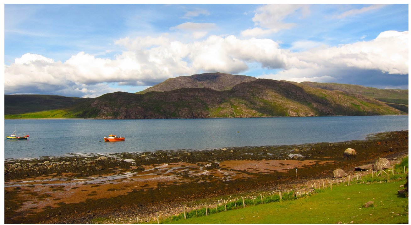
Photo above: Little Loch Broom on the Northern Scottish mainland, a 'fjordic' sea loch.