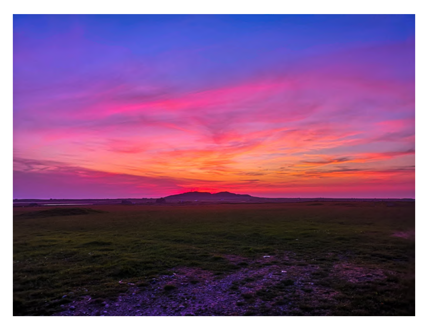
See previous page for comments on the photo above.