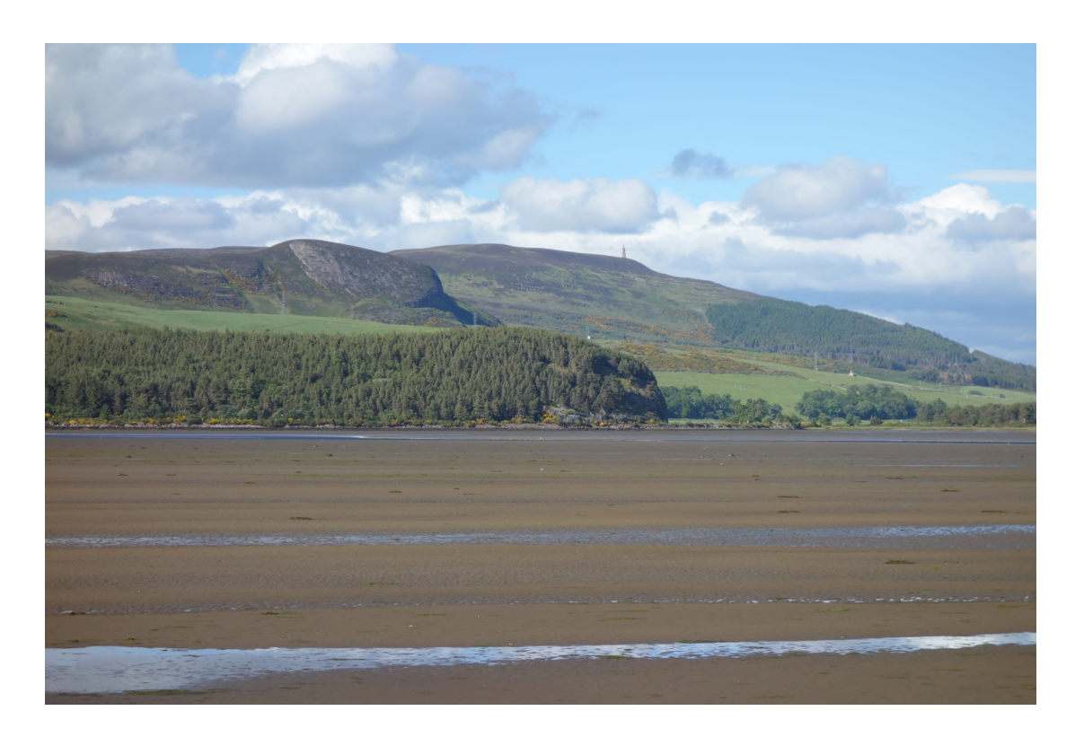
Photo above: Loch Fleet close to Embo in the traditional Gaelic speaking area of East Sutherland, showing a firth in a typical northeast coast landscape. When visiting this region I was very fortunate to meet the only two speakers of the dialect in Embo. I am grateful for this and remember it in my heart. Wilma has sadly passed away, god bless her and I thank her for her beautiful kindness. Amen

One difference of east Sutherland Gaelic which is recorded in the Survey of the Gaelic dialects of Scotland (1), is that initial broad g is pronounced [x] when under lenition. For example A' Ghàidhlig could be spelt something like a' Chàilig . The differences are too numerous to include here, but, some of the features of this dialect are generic things associated with Northern Gaelic dialects, for example n frequently becomes r. This is not limited to Northern Scotland but it occurs arguably in a much larger number of words in Northern Scotland. (Especially in East Sutherland, and some islands and N. areas)