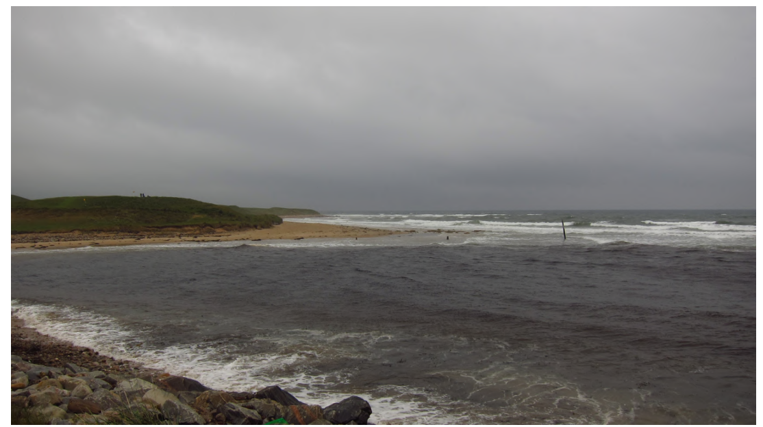
Photo below: another part of the East Sutherland coastline, close to Golspie.

A change from [a] to [o] or [o] is relatively common across Scottish Gaelic, this change is very common in certain words, in dialectal areas around the country. But in Northern Scotland one could argue that this change is somewhat more common, and the phoneme [o] also occurs in East Sutherland. This I write as å, for example informants 142 and 143 in (1) have this sound in falamh – 'empty', which could be written here as fålaí , the final vowel being pronounced close to [i] presumably but I am not certain on the exact pronunciation from the dialect survey. Another example is fairrge – 'sea', which, in the language of informants 142 and 143 (1) could be written as fårig . Note that the [g] in this word is likely close to the English [g]. The verb dh'fhalbhadh – 'would go' might be written as ch'fhålu in the language of informants 142 and 143 (1).