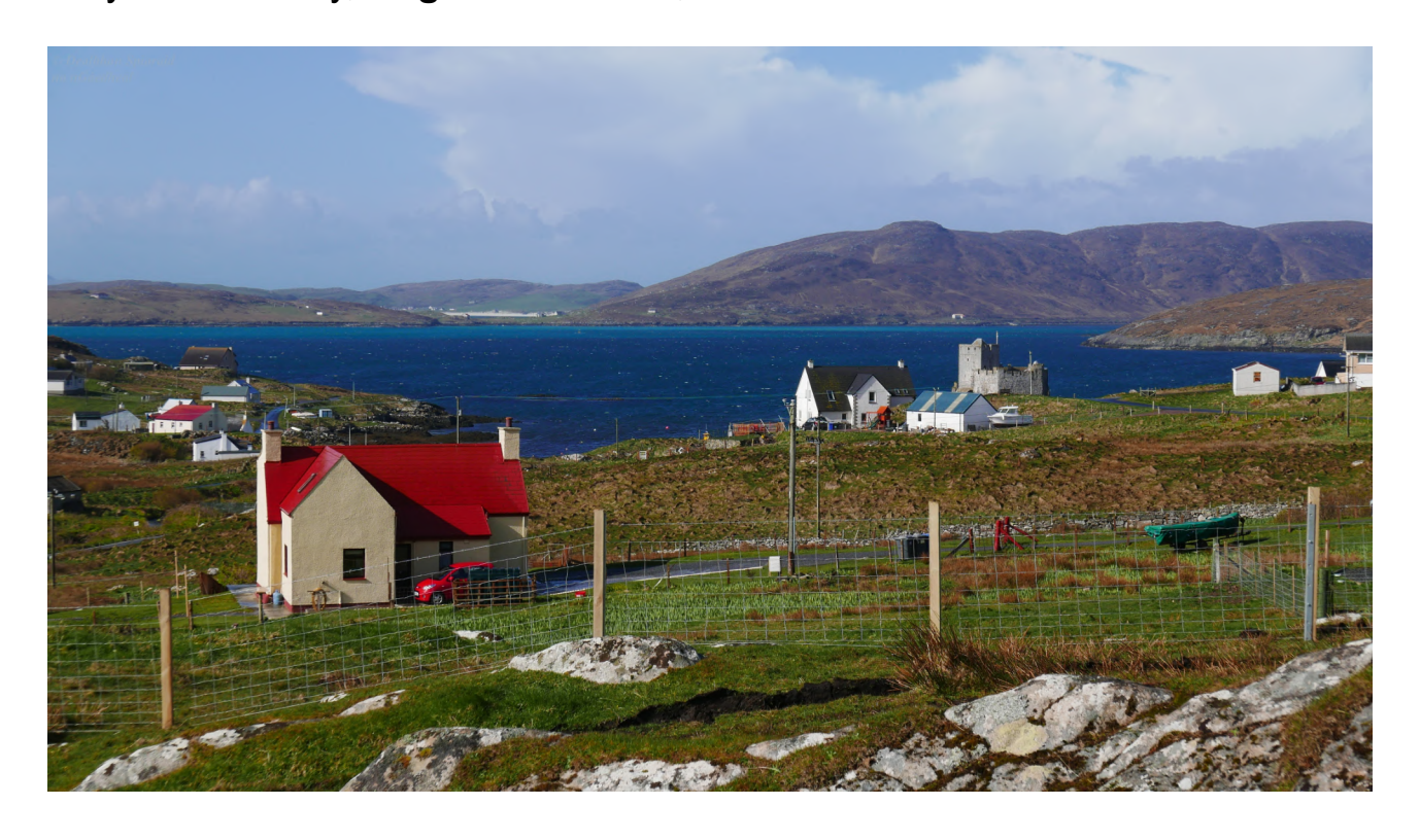
Photo above: another view of Castlebay Harbour on the Isle of Barra.

Above: the sacred island of Barra in the Outer Hebrides, showing the CalMac ferry at Castlebay, Bàgh a' Chaisteil , with Kisimuil castle to the left.