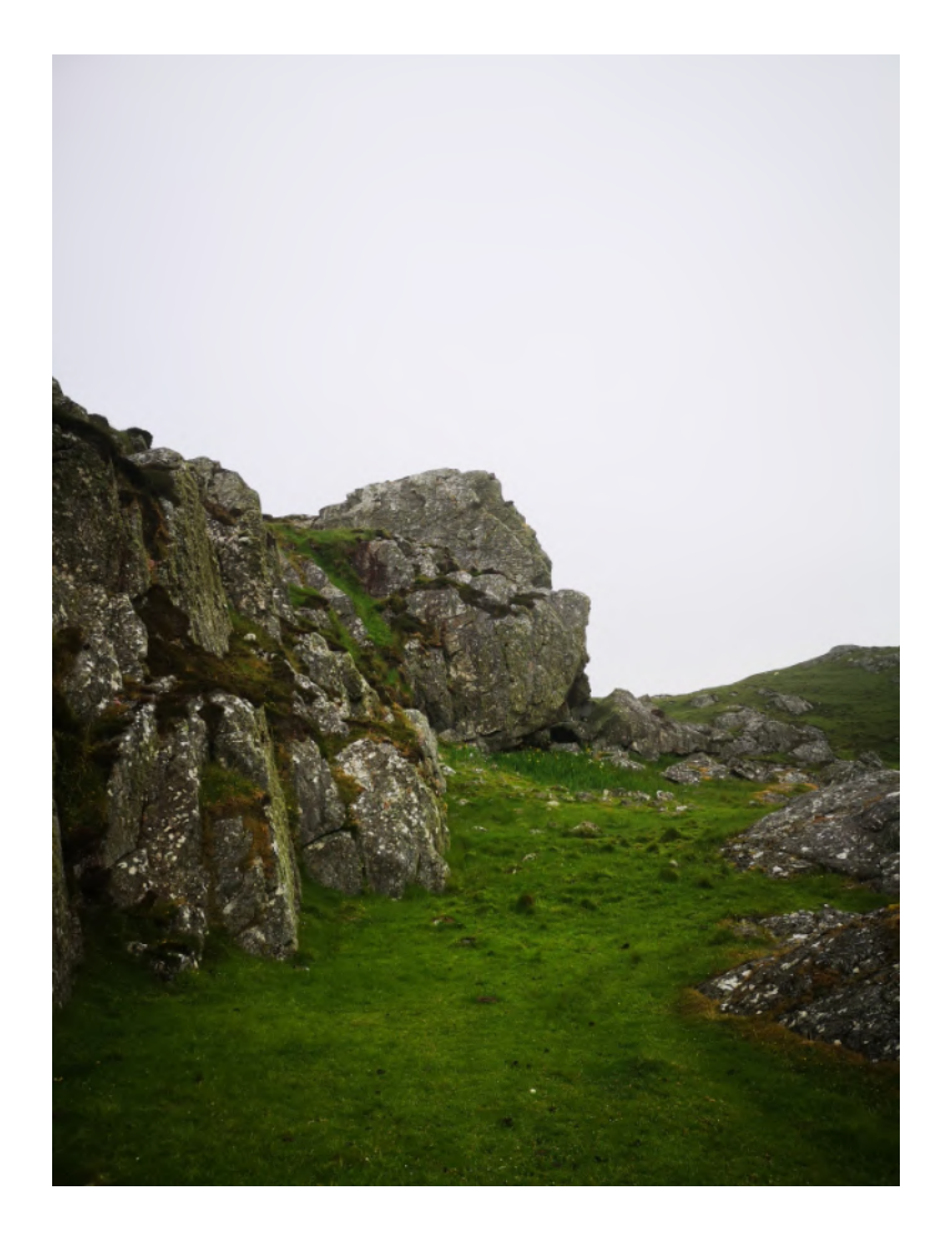
Photo below: the curious rock formation upon which stands the broch of Dùn Hiader .

I wanted to go on from here and visit another dùn some way to the east, but instead I felt this feeling, like a whisper, suggesting that I go down to the beach below the broch. I safely found my way down from the rock formation, for on the side away from the sea there is the remnants of a path. Just behind the beach, and near to the base of the fossilised giant-looking rock formation,