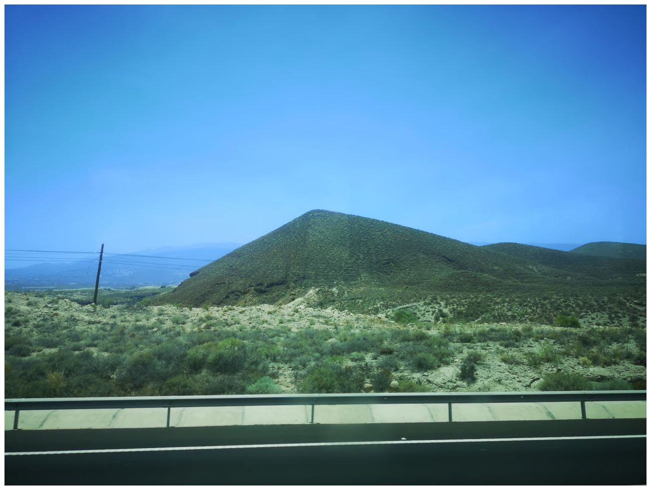
Photo above: the mysterious and magical Montaña de Ifara region of Tenerife, mentioned as potentially important in relation to a dream.