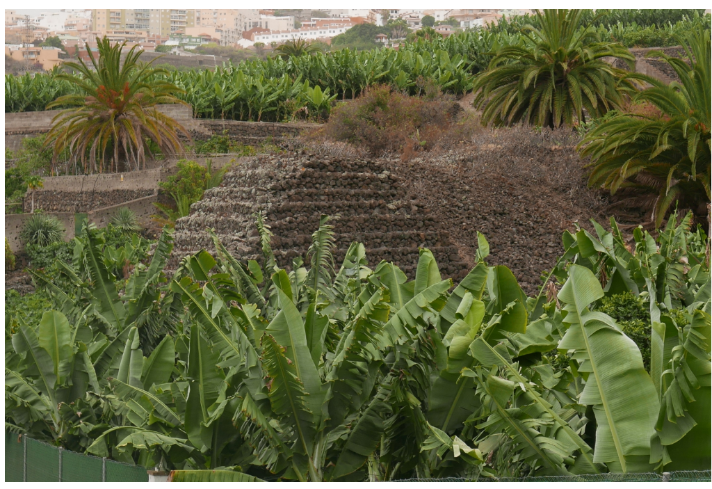
Photo below: San Marcos Pyramid 1, one of the San Marcos pyramids within a banana plantation and on private land, this photo shows the pyramid from a higher angle, with two sides to the pyramid clearly visible. To the right is what may have been another part of the same pyramid.

It is possible to see El Teide, or in Guanche: Echeyde , from many of these pyramid sites, including this one. The second photo on this page (the photo below this writing), shows the San Marcos most visible pyramid, called here San Marcos Pyramid 1, with second possible pyramid to the left (San Marcos Pyramid 2). The name given to this area is pirámides de San Marcos with the plural for pyramid being employed, so I presume that perhaps this other, similarly walled structure of the same height as the pyramid and to the left of it, may also be a pyramid or a part of the most visible pyramid's structure. Whilst on the road close to the site, I spoke to a local man in Spanish who did believe the pyramids were Guanche and who considered himself to be a Guanche too. The coordinates of the main pyramid are: 28°22'27.6"N 16°43'20.6"W. The coordinates of the second possible pyramid, San Marcos Pyramid 2 to the left on the image below are 28°22'27.4"N