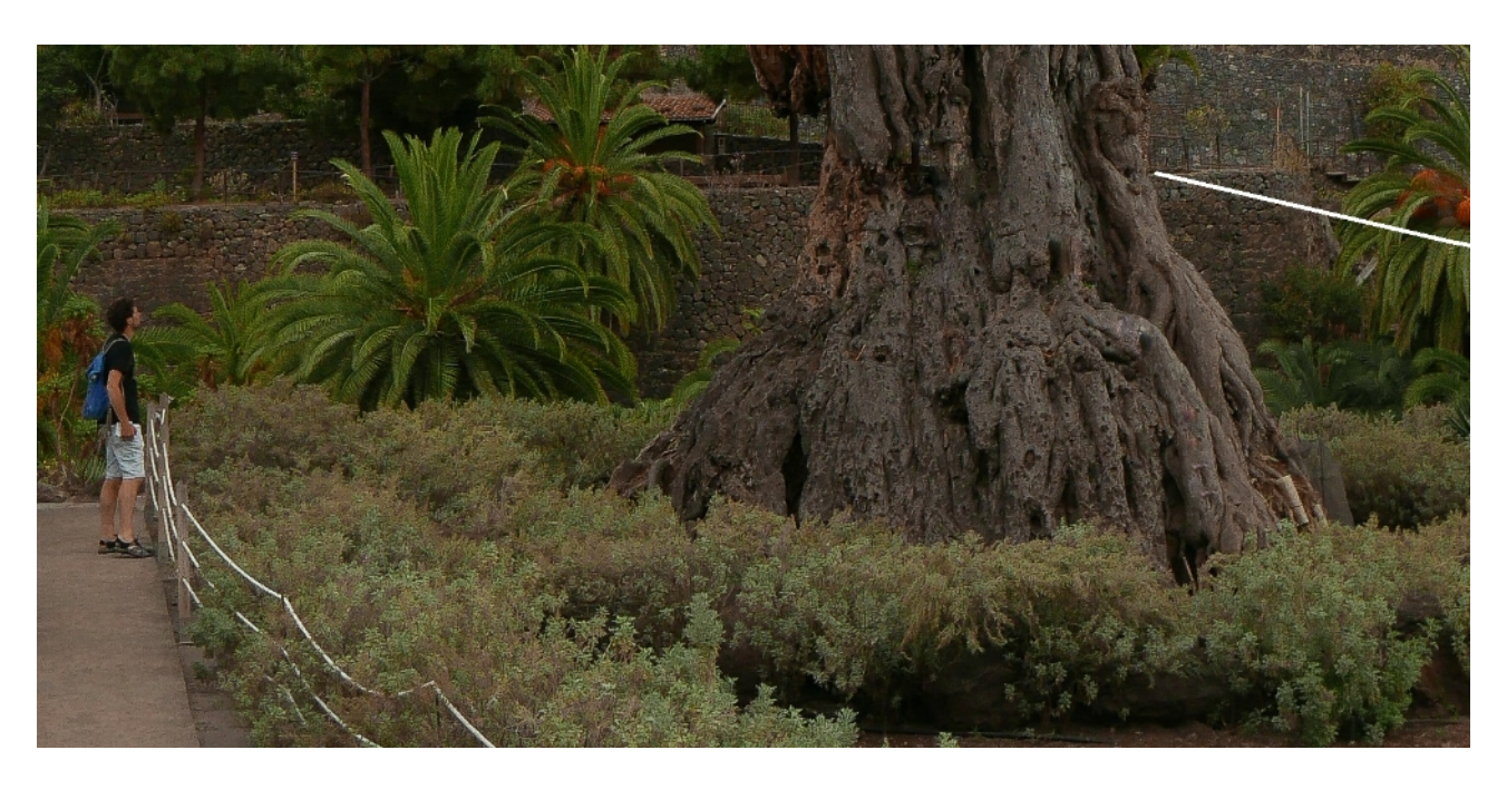
Photo below: the Drogo de Icod de Ios Vinos , an ancient dragon tree of the Canary Islands, a Dracaena Draco , with the author (30 years old) stood to the left of the tree, July 2023. Notice the giant female goddess shape on the right side of the tree's trunk, almost like her form is physically at one, and conjoined with the tentacle-like shapes of the tree. The white line from the right side of the photo, points to the cephalopod goddess shape in the tree. Photo taken by Ania for the author (myself) who is in the picture.

The tree is thought by some to be over a thousand years old, although different studies have suggested different ages for this tree. According to this web page: <a href="http://lacantimploraverde.es/drago-icod-los-vinos-tenerife-parte-2-2/">http://lacantimploraverde.es/drago-icod-los-vinos-tenerife-parte-2-2/</a>, the age of the dragon tree may be in the hundreds of years, but, according to this webpage, authors such as Lázaro Sánchez-Pinto Pérez-Andreu base the calculation of the tree's age upon the growth of the trunk roots, and according to this method the Drago de Icod de los Vinos is over a thousand years old. (Regardless of age it is certainly a sacred tree to the islanders)