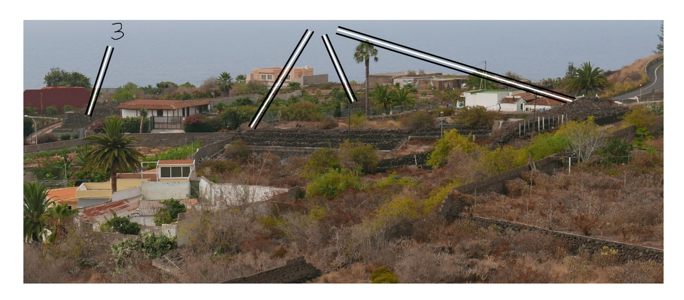
Photo above: some of the pyramids below La Manchica (see discussion on previous page). The number 3 on the left of this image and the lines heading away from it point to "La Manchica Pyramid 3", whilst the other lines point to different parts of the potential "The Lower La Manchica pyramid-structure". Note that the left-most lines point to a corner of the potential "larger structure" or "large pyramid" that the other parts may have attached to. The "long structure" is to the right, and the pyramid, or bit of the larger pyramid north of the road is pointed out by the central lines.

The photo below uses lines to point out "La Manchica Pyramid 4" and "La Manchica pyramid 5", with the lines going to those pyramids from the respective numbers drawn onto the image.