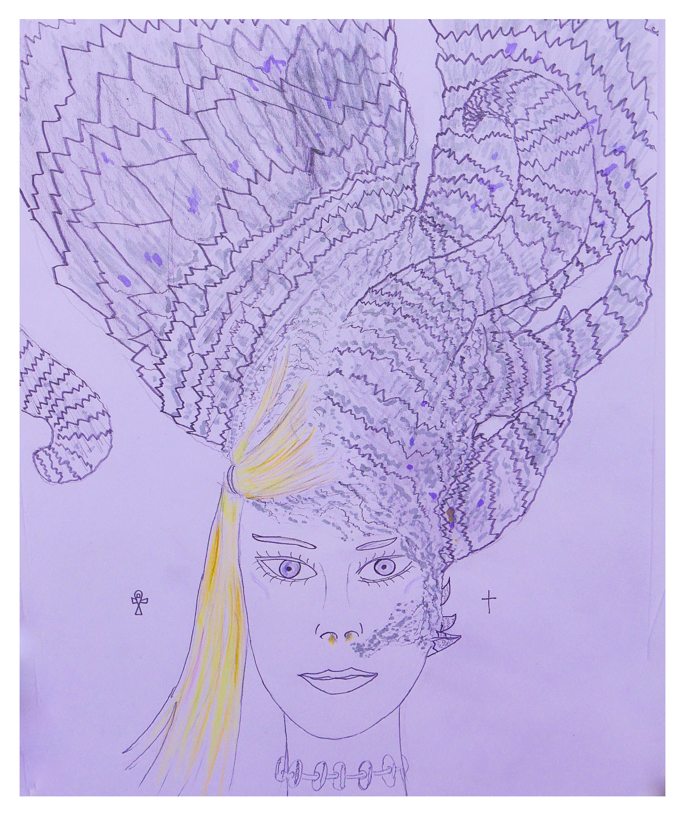
Photo above: another example of artwork showing a female adult goddess figure embodying the human form and the otherworldly "horned" consciousness, with blonde hair from her human "surfaces" and nose. The third and final piece of art in this book is on the lower part of the page after the next page, just after the references. (1 reference)