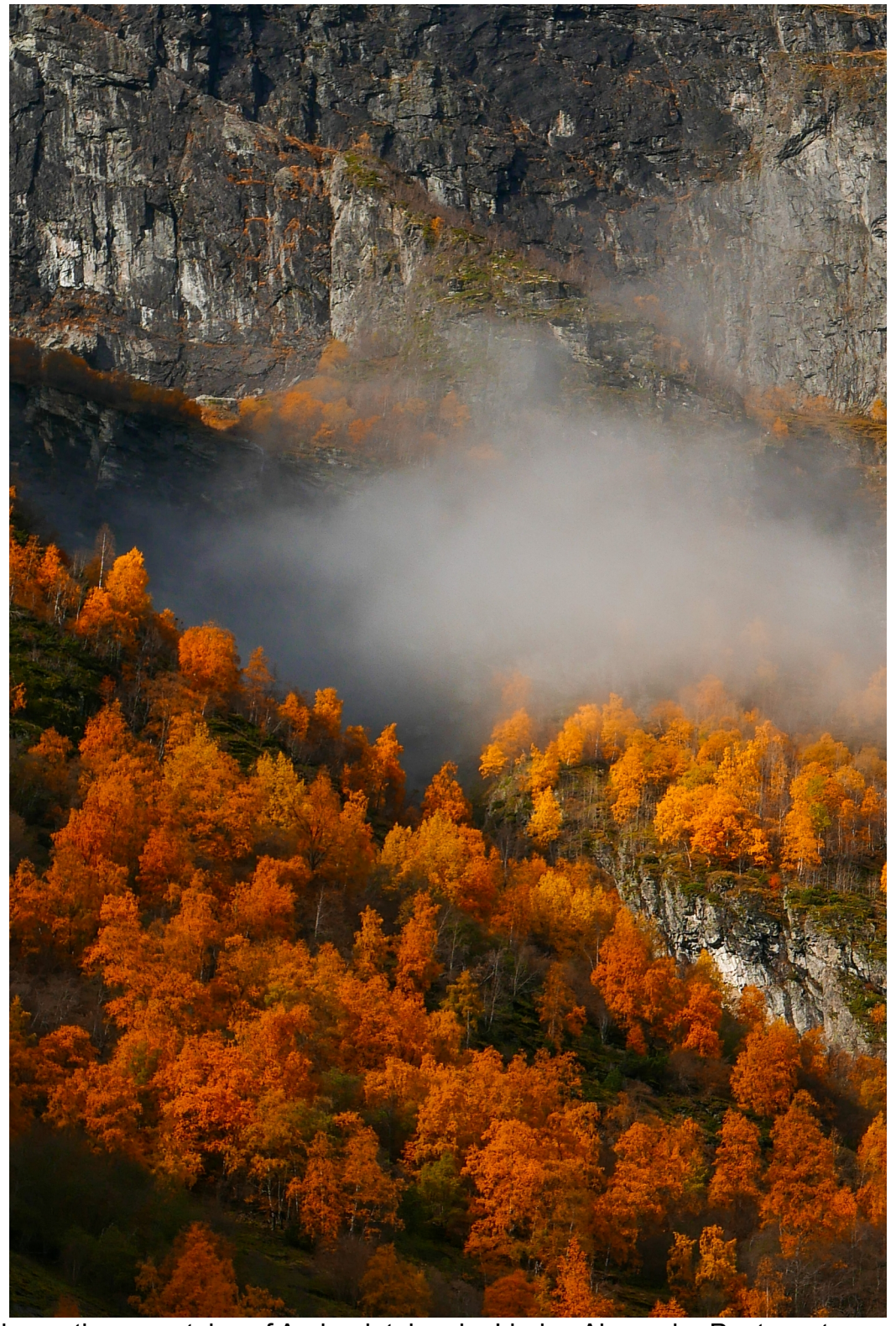
Photo above: the mountains of Aurland