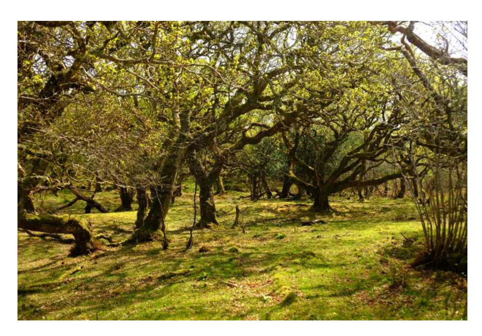
An dealbh os cionn: coilltean àrsaidh Atlantach ann an Diùra Photo above: ancient Atlantic forests on the Isle of Jura